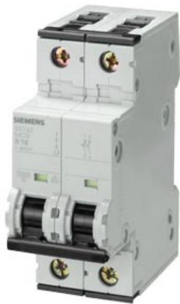
CIRCUIT BREAKER 400V 6KA, 2-POLE, C, 0.5A, D=70MM